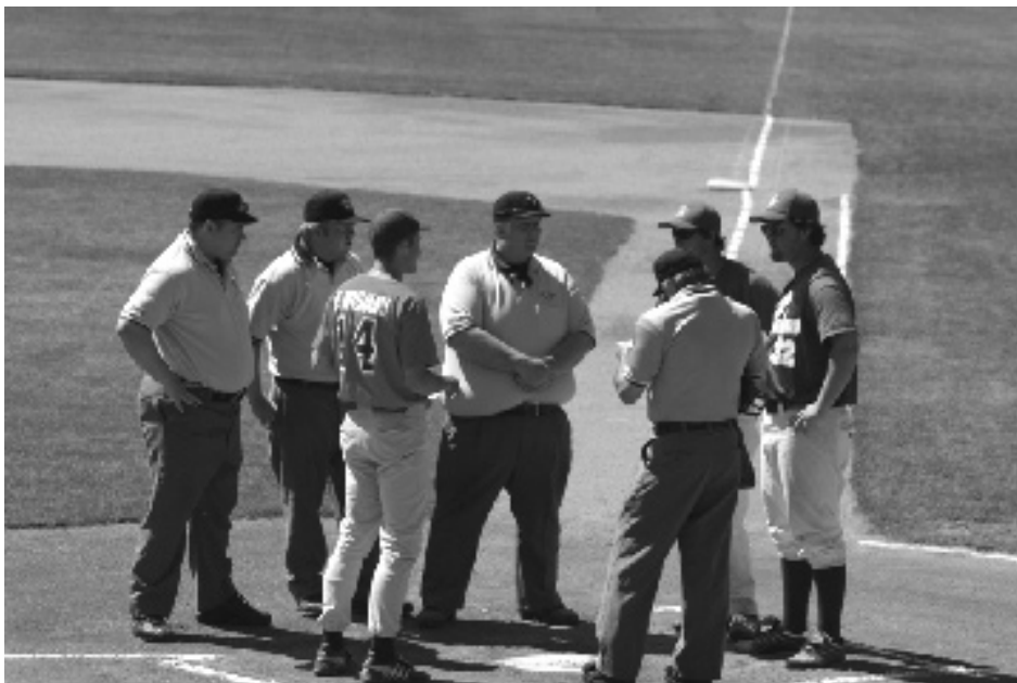
Gold Medal Plate Meeting at the Midget AAA Provincials 2005